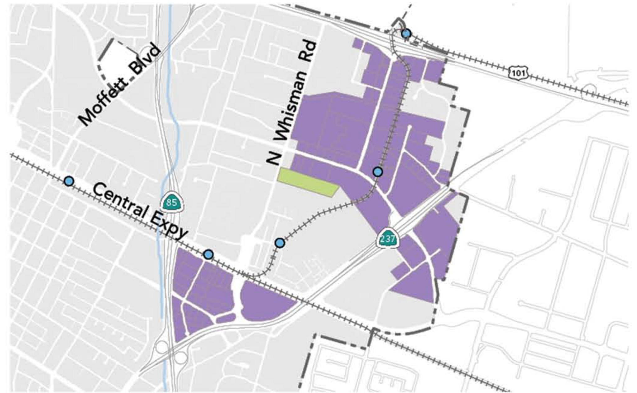
East Whisman - Land Use Option A

The Francia parcel allows for public-quasi public uses, such as City facilities and services.