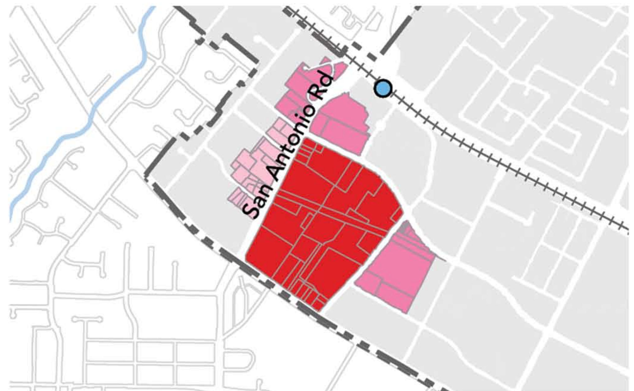
San Antonio Area - Land Use Option B